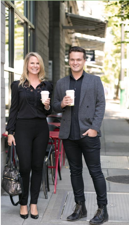
Your Local Mortgage Educators